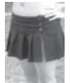
Skirts That Are Distracting