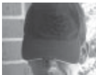
Hats or Caps Inside